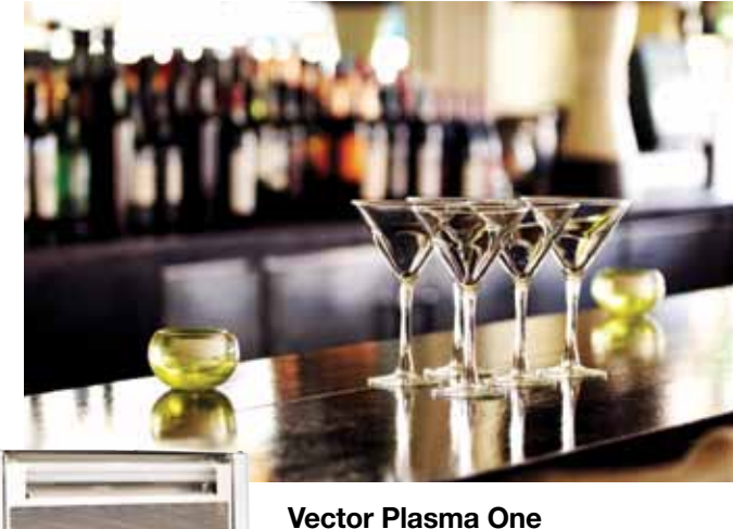
Great trap for bar areas or small rooms